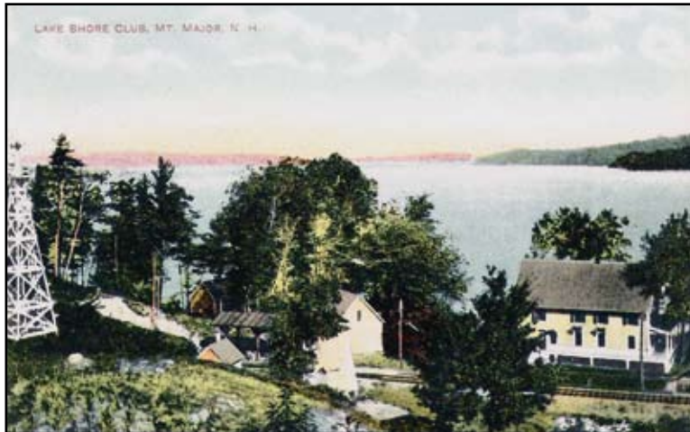
The Lake Shore Railroad had a stop near Mount Major.

In the summer he moved to Gilford and had a railroad station built down