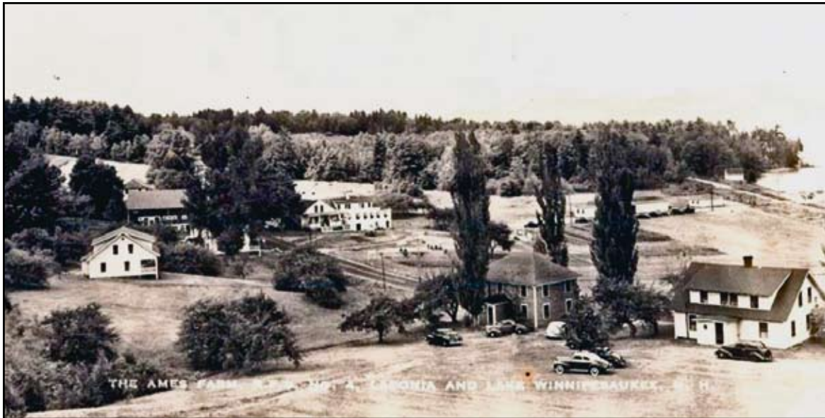
Ames Farm Inn has been hosting summer guests since 1891.