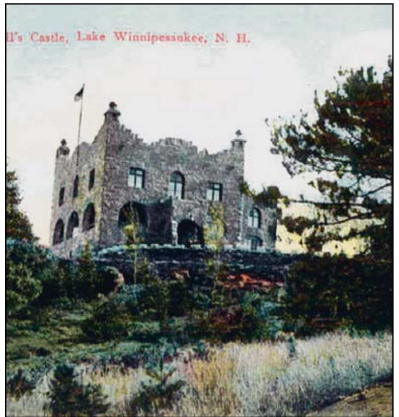
It took two years and $50,000 to build Kimball's Castle, which was completed in 1899.